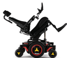
Posterior tilt adjustment