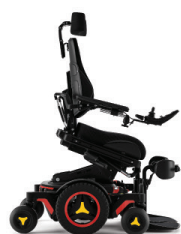
Anterior tilt adjustment